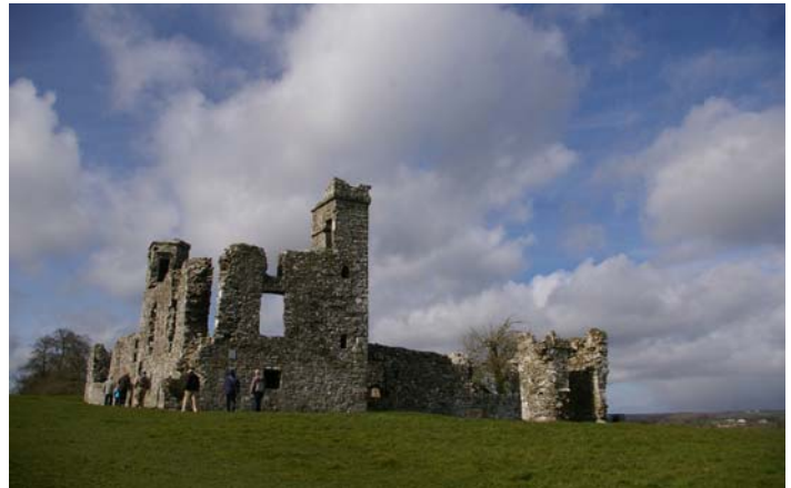
Above: Abbey Ruins on the Hill of Slane. Below: WVUC tour group at Newgrange, pre-Christian burial site and UNESCO world heritage site predating the Pyramids in Egypt and Stonehenge, England.